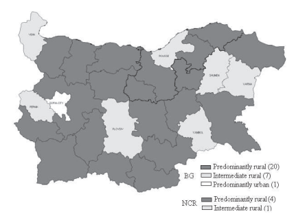
Fig. 1. Designation of rural areas at NUTS 2 level using the OECD methodology