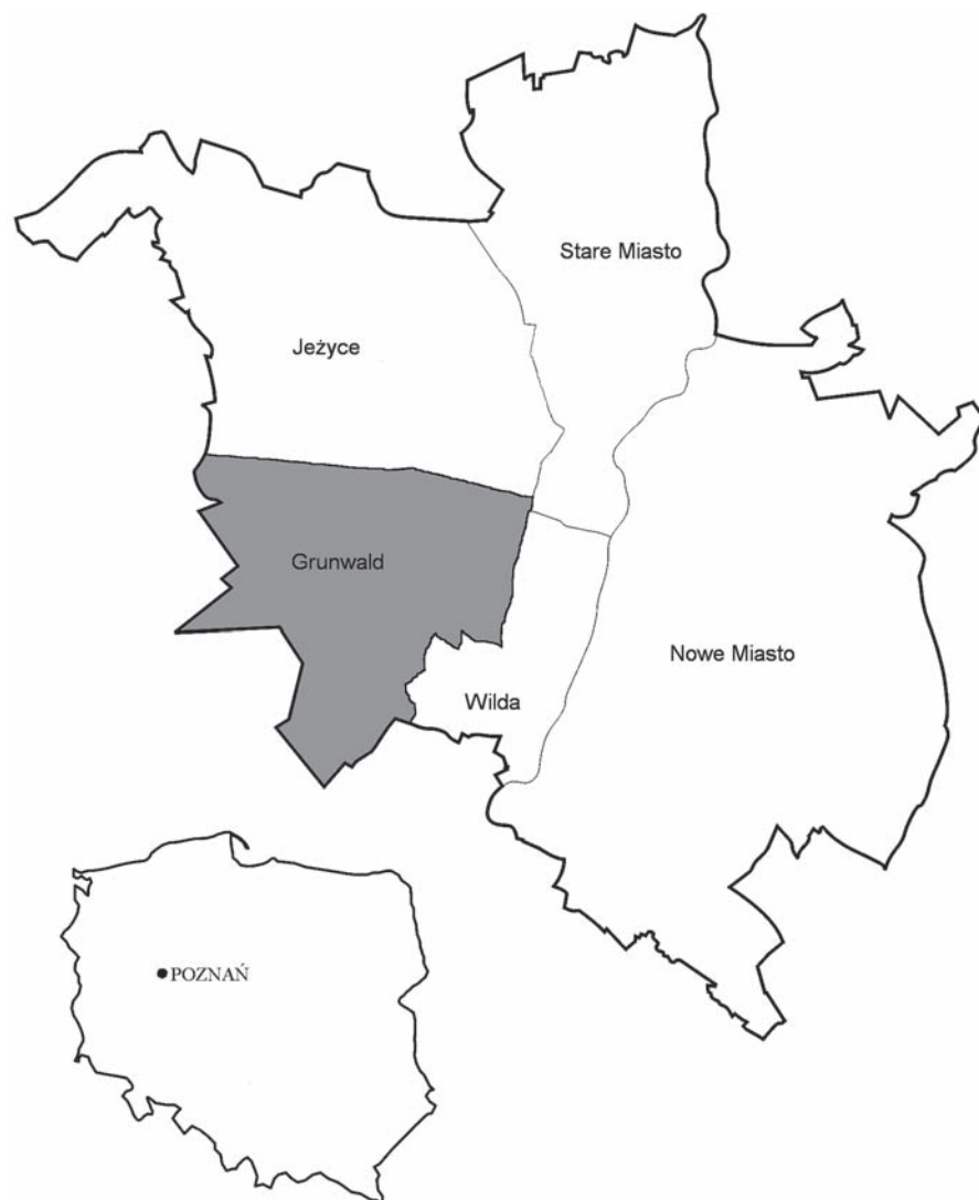
Fig. 1. District division of Poznań territory

Grunwald occupies the south-western part of Poznań (Fig. 1). The name of the district was adopted after WWII after the name of one of the main traffic arteries in that area, i.e. Grunwaldzka Street (Łęcki and Maluškiewicz, 1998). Grunwald is the third district of the city in terms of its size. In 2005 its area was 3619 ha and constituted 13.8% of the area of Poznań (The Statistical Yearbook of Poznań, 2007). The boundaries of the district are marked by the following streets: Bukowska, Roosevelta, Przełęcz, Głazowa, Piargowa, Leszczyńska, Pszczyńska, and the railway tracks of the Zbąszynek line and a stream, Strumień Junikowski.