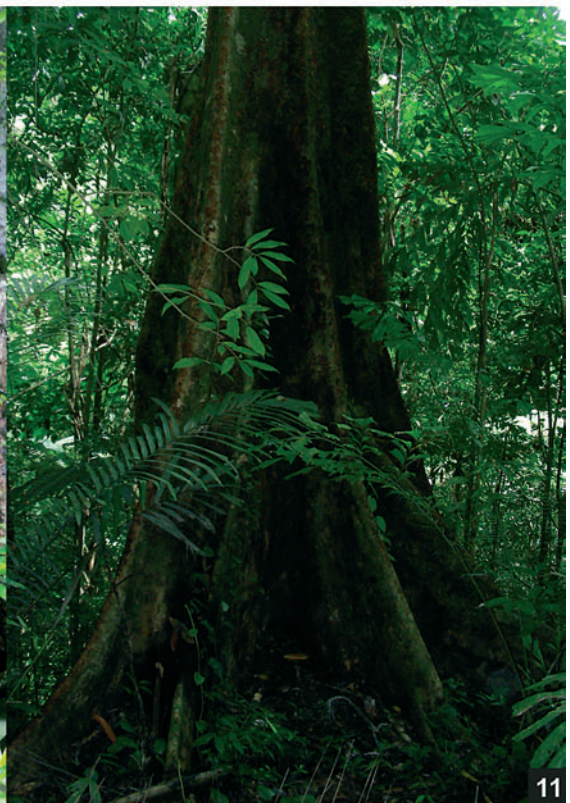
Figs 9–11: 9. Graph showing the relative popularity of various disciplines of malacology during the 2010 Congress and at the Polish Malacological Seminars 2006–2010; 10, 11. Rainforest at the Sirinath National Park.