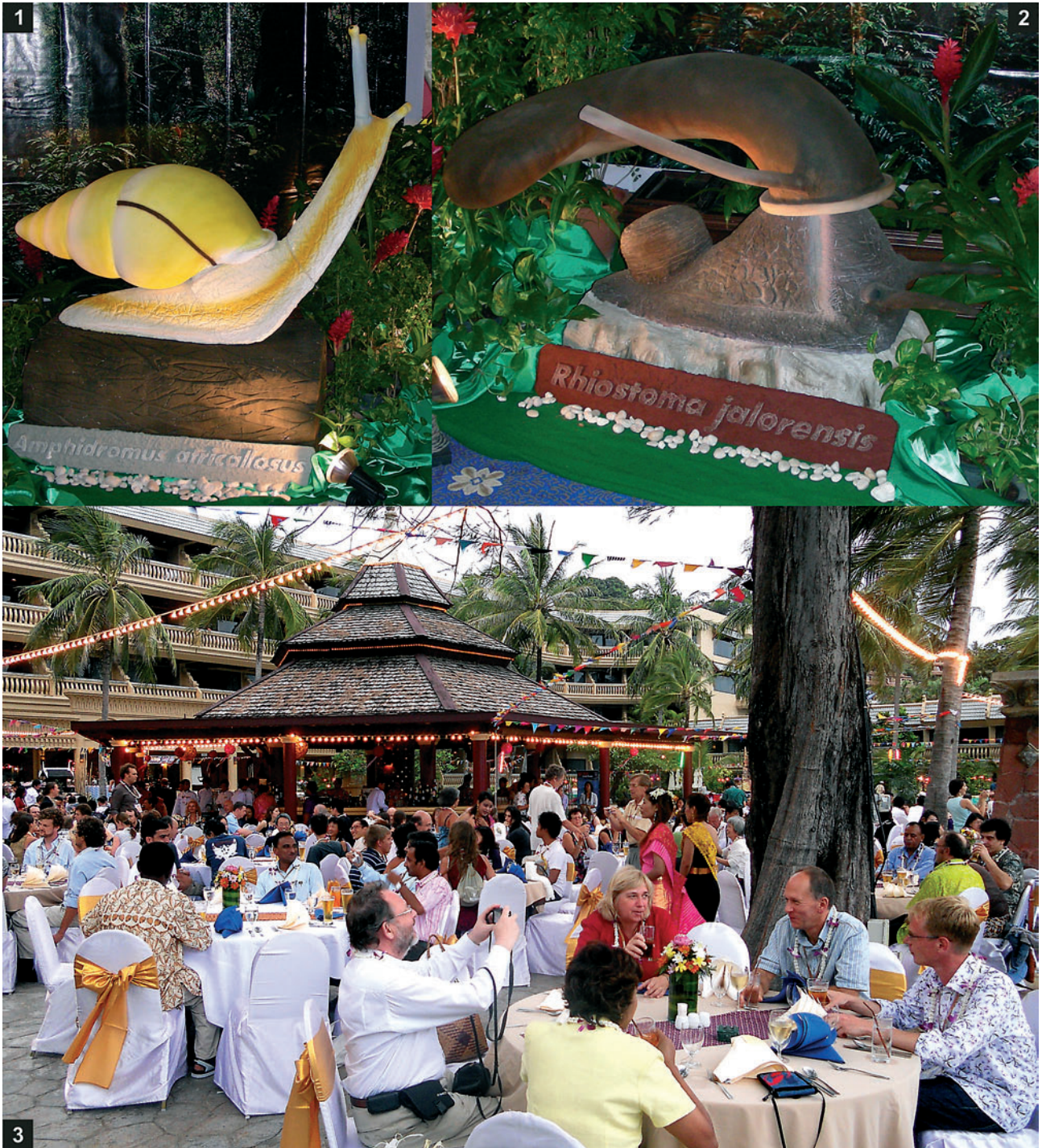
Figs 1–3: 1, 2. Mascots of the Congress.; 3. Farewell dinner at the Kata Beach Resort & Spa.

The list of participants in the Book of Abstracts included 320 people; we suspect a few of them failed to appear, though we know of only two such people (and they were Greek), but below we list the countries and the numbers of participants as they appeared in the