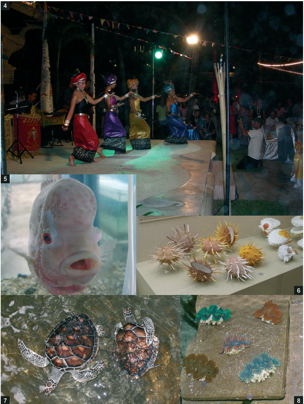
Figs 4–8: 4. Folk dance during the farewell dinner; 5. A fish who liked to be photographed, Phuket Aquarium; 6. Sea Shell Museum – a fragment of the exhibition; 7. Baby sea turtles, Marine Biological Center; 8. Baby Tridacna , Marine Biological Center.