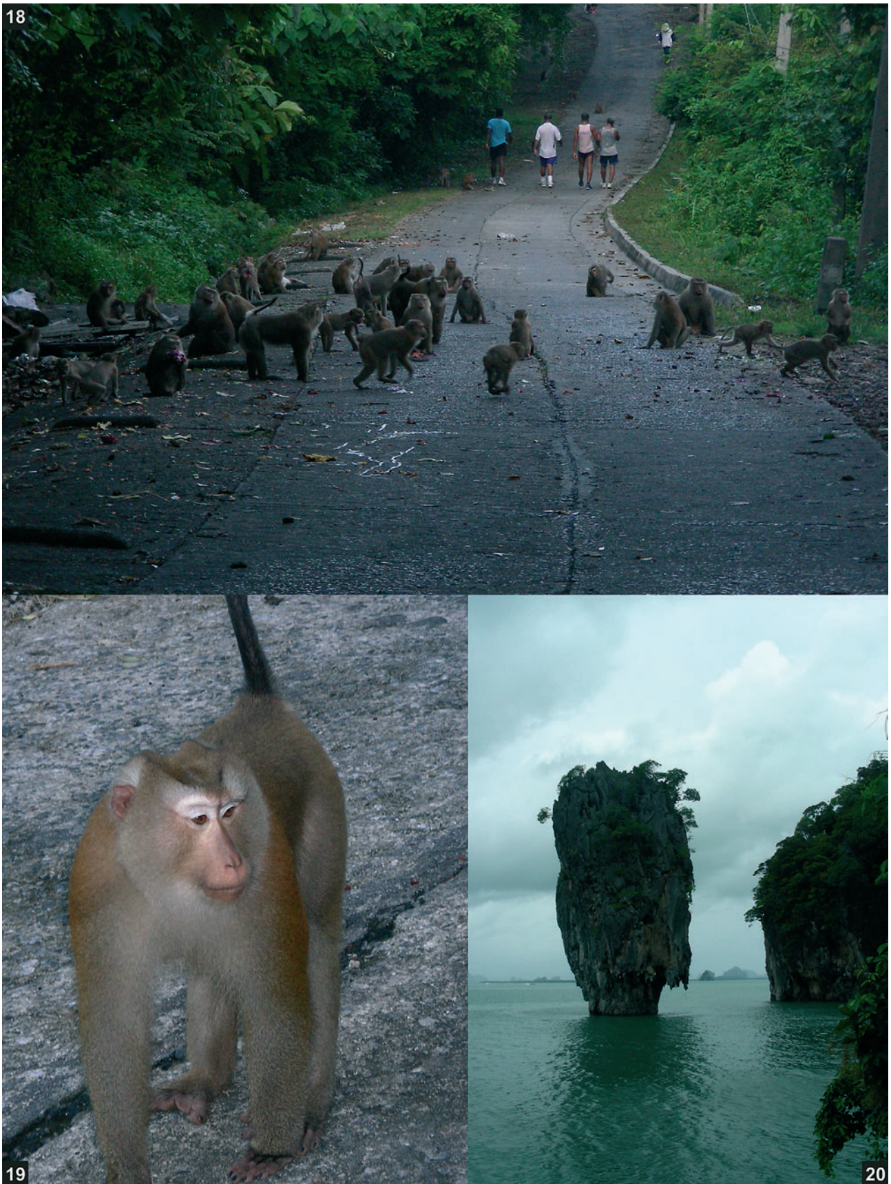
Figs 18–20: 18, 19. Monkeys on the way to the "TV Hill". 20. An island just about to fall over.