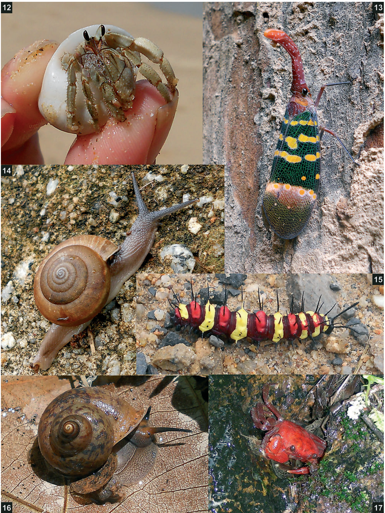
Figs 12–17. Some of the creatures we saw: 12. Hermit crab; 13. Cicada; 14. Cryptozona snail; 15. What we called “kebab caterpillar”; 16. Cyclophorus snail; 17. Amphibious crab.