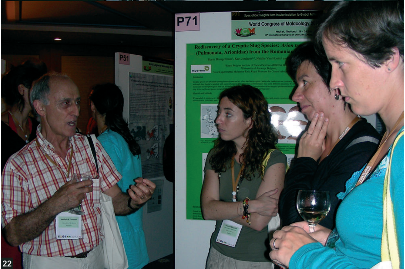
Figs 21–22: 21. Village on water; 22. Poster session. The newly elected President of the Unitas being charming to girls.