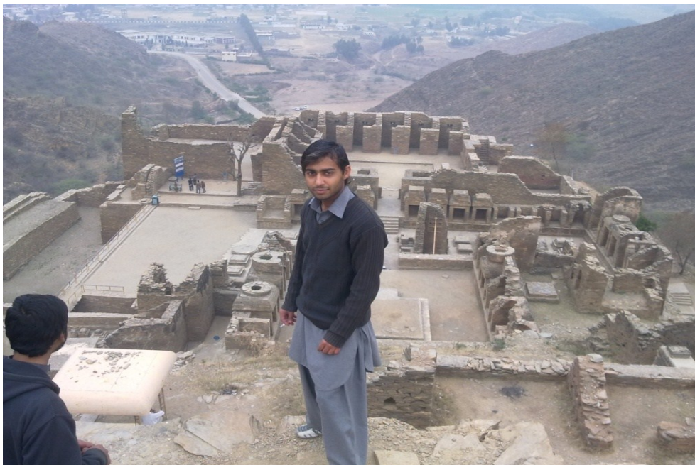
Figure 2. Buddhist monastic center in Takht Bhai, District Mardan.