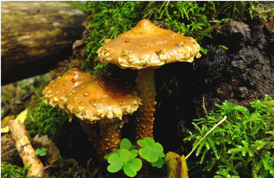
Fig. 7. Pholiota albocrenulata , saprobe or parasite growing at the base of deciduous and coniferous trees; threatened (E category).