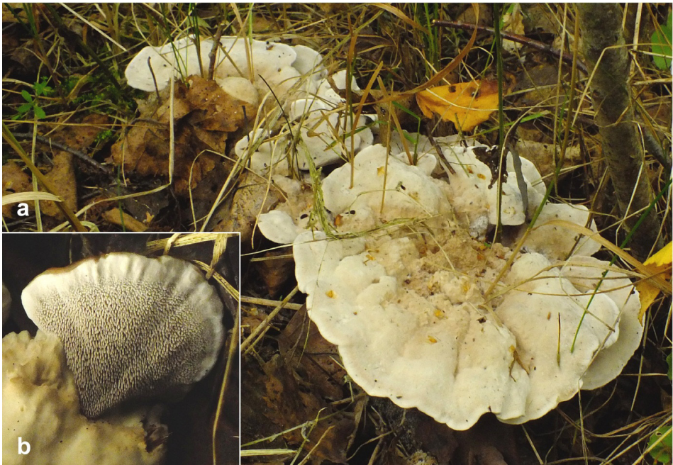
Fig. 6. Phellodon confluens : a – general view of fruitbodies in natural habitat, b – spines with hymenial layer at the fruitbody lower surface. Species regarded as extinct in Poland (Ex category).