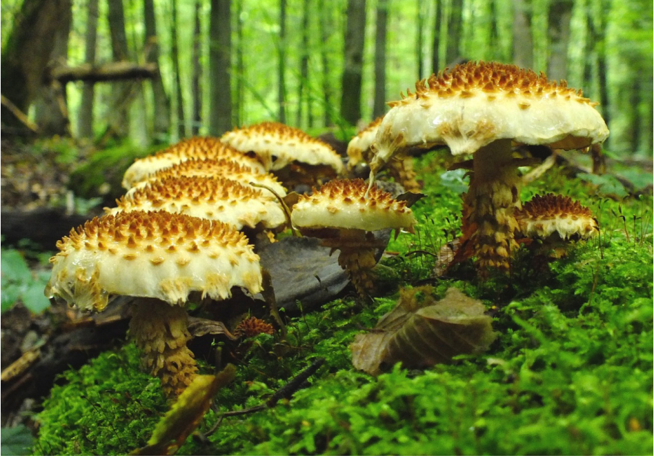
Fig. 8. Pholiota squarrosoides , saprobe decomposing wood of deciduous trees, characteristic to natural plant communities; endangered in Poland (E category).