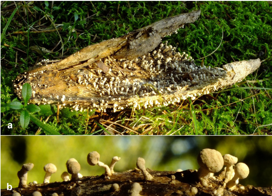
Fig. 2. Onygena equina , keratinophilic species decomposing animal remnants: a – general view of substrate, presumably hoof of elk, a – fruitbodies, magnified. Species threatened due to its rarity (R category).