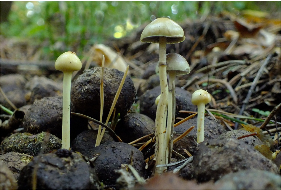
Fig. 9. Stropharia alcis , very similar to S. semiglobata , distinguishable by the shorter and narrower basidiospores; species new for Poland.