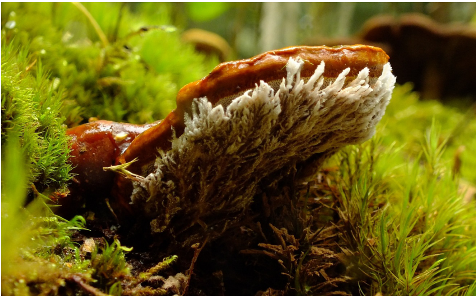
Fig. 3. Ganoderma lucidum , fruitbody with anamorphic state visible on its lower surface; threatened (R category) and protected in Poland.