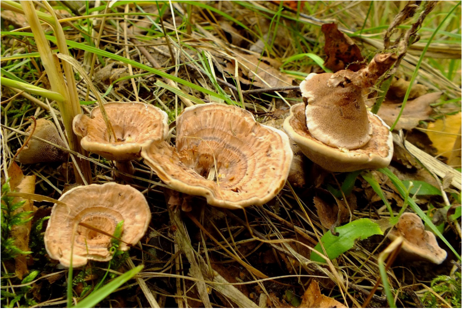
Fig. 4. Hydnellum conrescens , mycorrhizal species, threatened (E category) and protected in Poland.