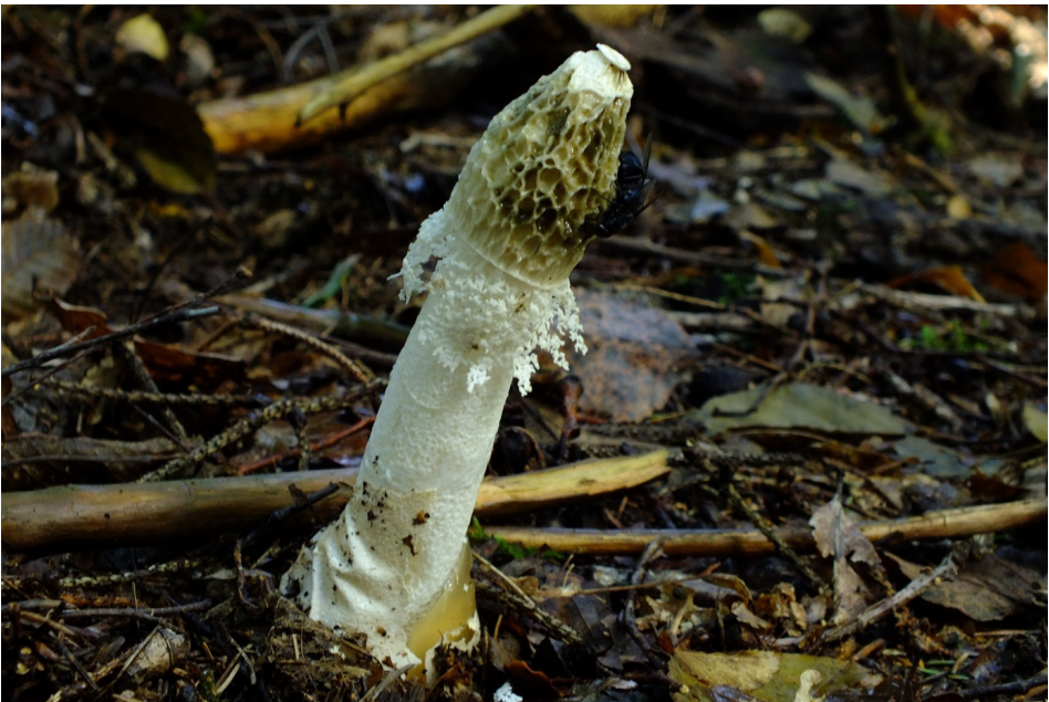
Fig. 5. Phallus duplicatus , fruitbody with characteristic short, net-like indusium hanging from the margin of cap-like part of the receptacle; species very rare in Poland and threatened (E category).