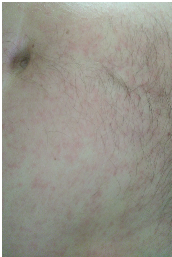
Fig. 1. Disseminated spotted skin rash

larvae, cysts. This gold standard can only be achieved only by repeated examinations [6].