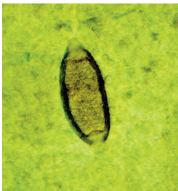
Fig. 2. Trichuris trichiura ; egg

(Salonga National Park), where he spent three days in the jungle, walking and swimming in a small boat along Lokoro and Momboyo rivers. He was swimming in the river. He used filtered water but sometimes he drunk water directly from Lokoro river. He ate fishes, manioc and vegetables prepared by local citizens. After returning to Poland high fever and disseminated skin spotted-rash appeared. In emergency Infectious Diseases Department, HIV infection (4th generation HIV-test) and measles were excluded. He was admitted to the Department of Tropical and Parasitic Diseases with a suspicion of acute parasitic illness because in the peripheral