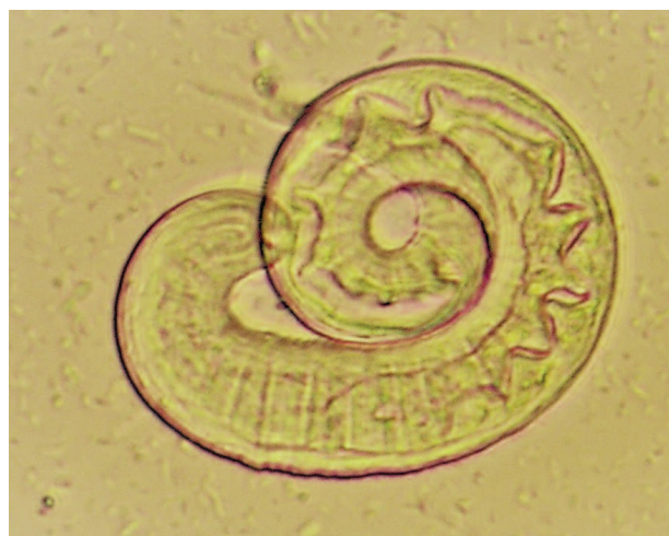
Fig. 4. Strongyloides stercoralis ; larva (Harada-Mori stool culture)

Skin rash is one of the symptoms suggesting parasitic infections. Allergic manifestations in the clinical course of strongyloidosis and schistosomiasis have been described [8]. It is connected to parasites circulation within the host organism as well as host immunological response [9,10]. These