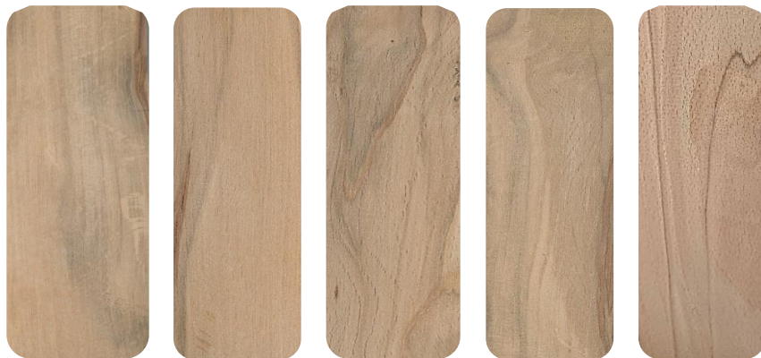
Fig. 2 The color of the false heartwood European beech