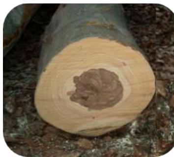
Fig. 1 View of the frontal cut of a beech wood with a false heartwood.

The measurement of the color of the wood of the false heartwood (Fig. 1) was performed on beech wood from Štiavnické vrchy (South-western Carpathians, Slovakia). 30 sections with a healthy round false heartwood were selected from each location. 5 pieces of blanks with dimensions of 24 \times 38 \times 800\text{ mm} were randomly selected from the central lumber of each cutout.