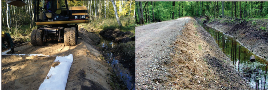
Photo 1. Construction of the experimental stretch of road and a view of the experimental stretch on the day of measurement.

characterized by a very high groundwater level, temporarily appearing also on the surface, whereas the road surface was strongly hydrated subsoil partly covered by swampy vegetation.