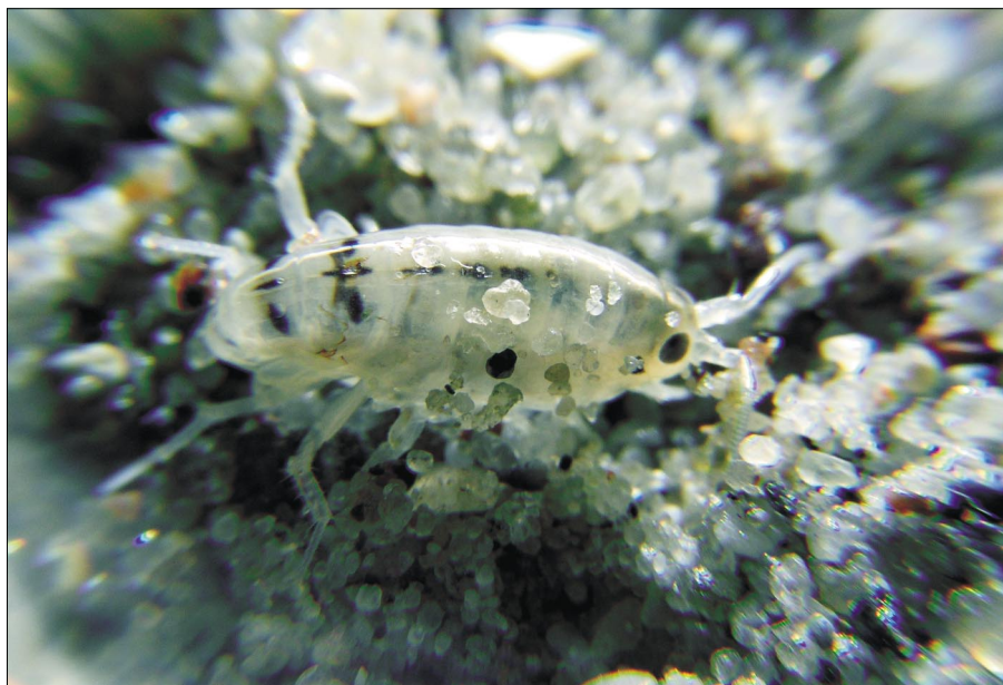
Photo 1. Talitrus saltator from the sandy beach in Gdańsk, June 2005 (length 13.5 mm). Normally greyish-brown in colour, larger individuals possess a distinctive black/brown streak that runs the length of the dorsal surface