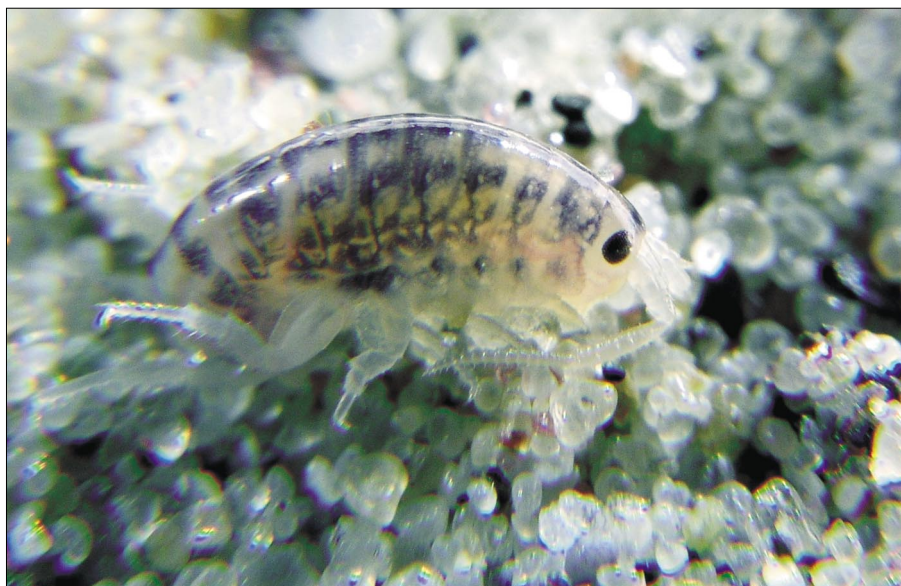
Photo 2. Talorchestia deshayesii from Puck Bay, May 2005 (♀ length 8.5 mm). Although they can be variable in colour (brown, green or even orange/red), individuals often possess three lines of darker spots running the length of the dorsal surface