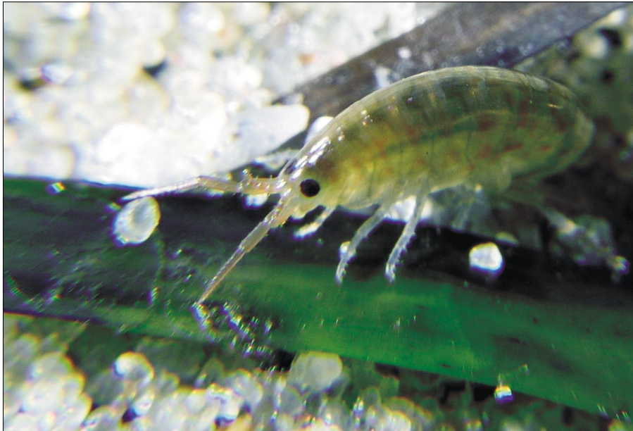
Photo 3. Platorchestia platensis from Puck Bay, May 2005 (♀ length 9.3 mm). The body colouration of this species can be very similar to Orchestia gammarellus and Orchestia cavimana , ranging from dark blue through dark brown and greenish brown, sometimes orange

1981) and to the Baltic coast of Sweden and Germany by the 1990s (Zettler 1999, Persson 2001, although see the much earlier record of Urbański (1948), confirmed by Köhn & Gosselck (1989), showing that P. platensis was present at numerous points along the German Baltic coast more than a half century ago). It has also been recorded from the Netherlands (Den Hartog 1963) (but not the deltaic region (Platvoet & Pinkster (1995)) and the Thames in the UK (Wildish & Lincoln 1979).