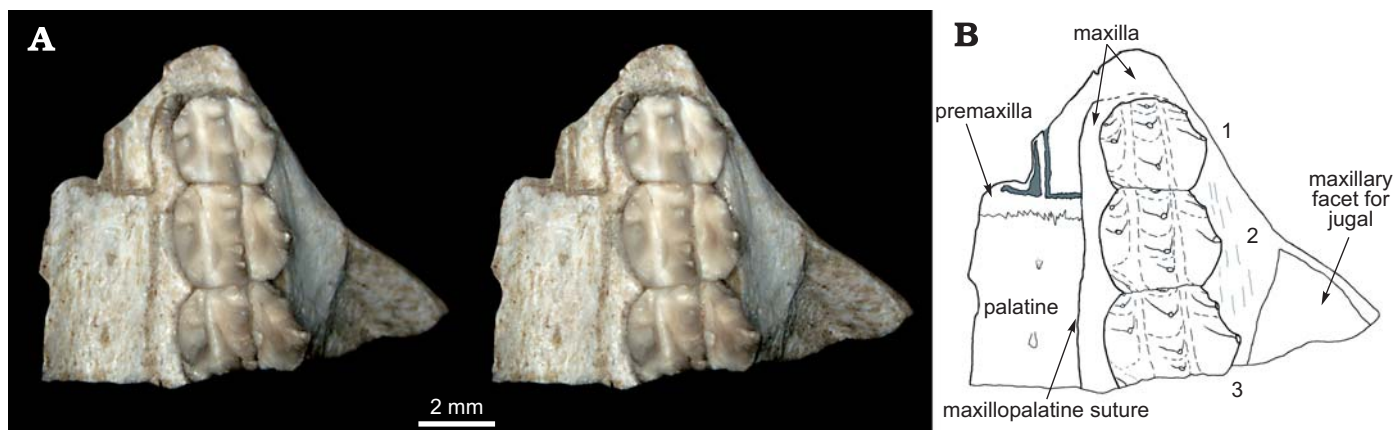
Fig. 1. Tritylodontid cynodont Yuanotherium minor gen. et sp. nov. from the upper part of the Shishugou Formation (Oxfordian, Late Jurassic), Junggar Basin, northwestern Xinjiang, China. IVPP V15335 (holotype), fragment of upper jaw and three anterior postcanines in occlusal view. Stereo pair (A) and explanatory drawing (B). 1–3, the first, second and third left upper postcanines.