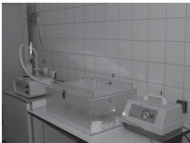
Figure 3. An inhalation challenge set for mice during inhalation. The chamber is filled with nebulized allergen extract.

1) ultrasonic aerosol generator, 2) inhalation chamber, 3) vacuum pump.