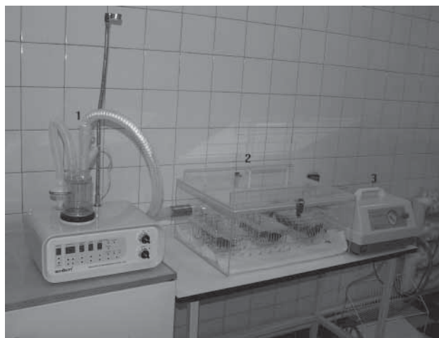
Figure 2. An inhalation challenge set for mice before inhalation.

1) ultrasonic aerosol generator, 1-A) upper vessel of the nebulizing chamber, 1-B) lower vessel of the nebulizing chamber with piezoelectric converter, 1-C) notched aerosol pipe transporting aerosol, 2) airtight inhalation chamber, 2-A) perforated containers for mice, 2-B) mounted filter, 3) vacuum pump.