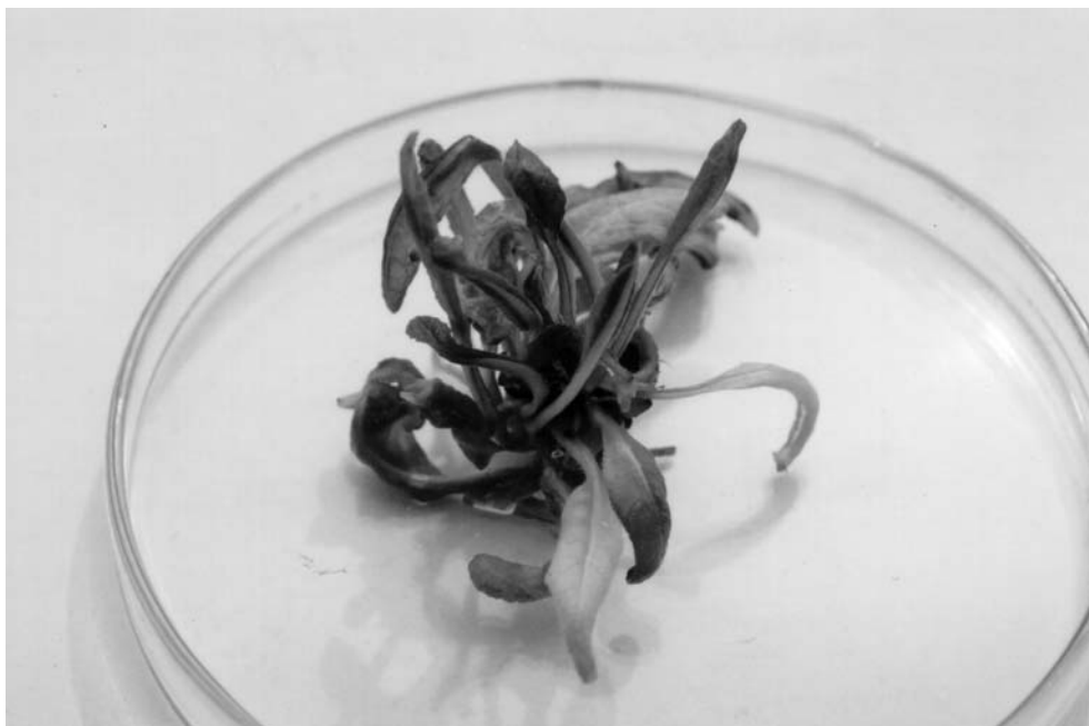
Fig. 1. Multiple shoots regenerated from node explant of Inula royleana on MS medium supplemented with 0.1 \mu M NAA and 5.0 \mu M kinetin.