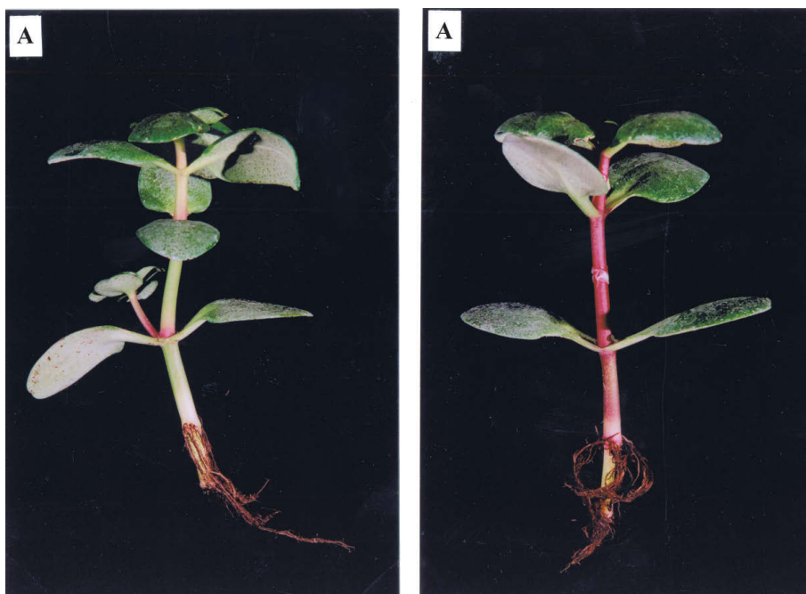
Fig. 1. The effect of JA Me applied in the middle part of the Crassula multicava internodes on anthocyanins accumulation; plants were treated in January and photographed 19 days after treatment (DAT)