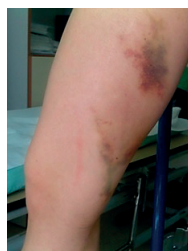
Figure 1. After EVLT of insufficient GSV

Technical success was fully achieved. Hospitalization lasted 4 days due to the need for VWF parameters monitoring. No major local or bleeding complications were observed. The patient was evaluated clinically and by ultrasound imaging on the day of discharge and at 1, 3, 6, 12 and 18 months after EVLT. Mild pain, local skin burns and superficial haematoma were observed during the first three weeks (Fig. 1). During the follow-up period, one month after the procedure, there was no need to perform complementary