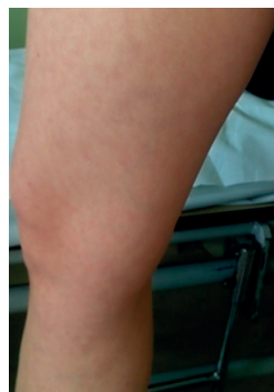
Figure 3. Excellent cosmetic result 18 months after EVLT

foam sclerotherapy of varicose tributaries. Cramping and skin pigmentation in ablated GSV area disappeared 3 months after the procedure. At 18 months of follow-up, the trunk of GSV was still occluded (Fig. 2). The very good aesthetic result was maintained (Fig. 3). No serious late complications were noted throughout the entire observation period.