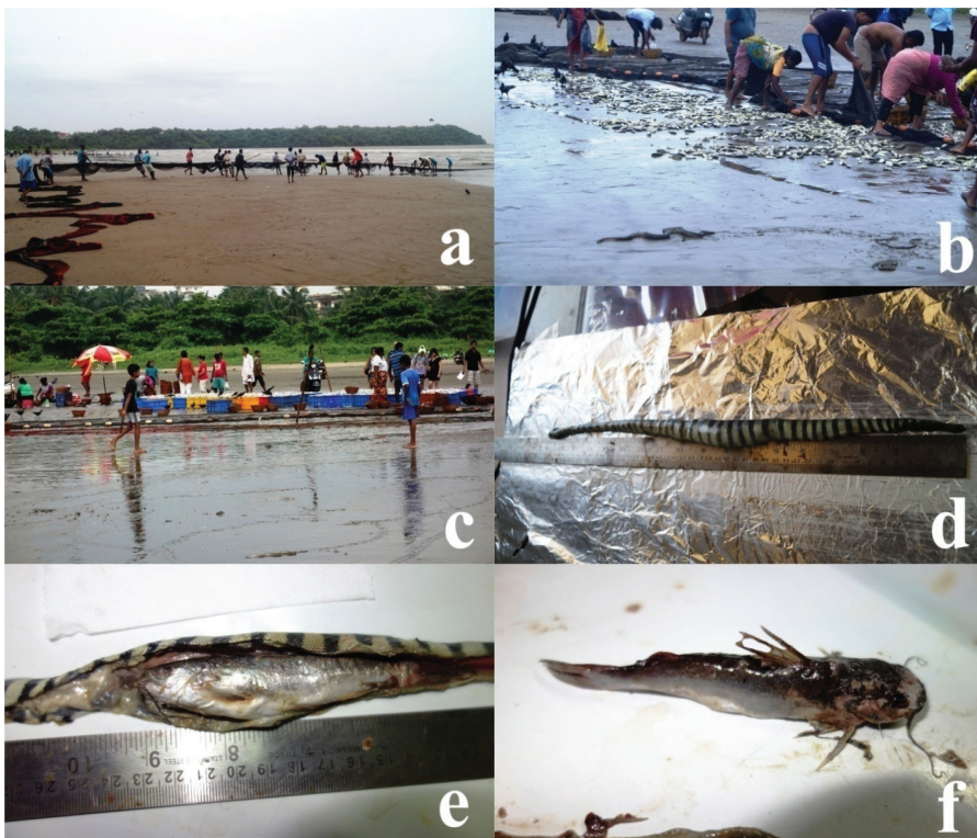
Figure 2. In-situ and laboratory observations during the study (a) Seine net operation activity, (b) Discard of by-catch during sorting, (c) Sorted catch after hauling and By-catch removal (note the trails in the foreground made by stranded snakes), (d) Sea snake species Hydrophis schistosus , (e) Dissected H. schistosus showing gut content, (f) Specimen from the gut (indigested Arius jella )

Sampling was carried out twice in a week during August–September 2017 and 2018 after the annual fishing ban period (June–July, a total 61 days during the Southwest monsoon). Counts were carried out of all the sea snakes entangled in the shore-seine net and landing on the beach, followed by a count of dead and live sea snakes. Immediately, after the sorting of landed fishes live snakes were released back into the sea while the dead snakes were brought to the laboratory for further analysis. Morphological identification confirmed that the sea snake species is Hydrophis schistosus (Rasmussen, 2001). Fishing gears operated in study area were noted, which revealed that traditional fishing activities such as shore-seine net (locally known as ‘Rampani/Yandi’), operated at a depth of 4–5 m, covering an area of 1.5 km 2 at the mouth of the Mandovi estuary (Figure 2a). The mesh size varies from 10–20 mm and seine nets use sinkers at the bottom and float at the surface, and manually dragged. This traditional fishing method results in the considerable amount of by-catch along with the targeted fish species (Figure 2b). Significant by-catch of sea snakes H. schistosus during this fishing operation (Figure 2c) was noted. In the laboratory, measurements were conducted for length-weight of each dead snake specimen (n = 40) followed by gut content analysis (Figure 2d, e).