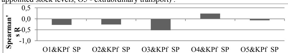
Fig. 1. Deviations in material flows depending on the degree of product processing

In particular stages of the research the authors used factor analysis grouping factors causing disturbances into 6-factor groups in respect of the frequency of appearing disturbances, and then into 6-factor groups in respect of the strength of the influence of disturbances on the organization. The authors also examined correlations between the distinguished factors and deviations in material flows. While analysing deviations in material flows realized in the distribution network of metallurgic products the authors found that the frequency of unrealised orders decreases together with the degree of the product processing (Spearman's R = -0.52 , p=0.0001 ). Moreover, the researchers also obtained an essential relation showing that the frequency of unrealised orders decreases together with the growth of the degree of the product differentiation (Spearman's R = -0.44 , p=0.0017 ). Fig. 1 presents the influence of the degree of product processing on all the investigated deviations in material flows (O1 - Unpunctual realization of the order, O2 - Incomplete realization of the order, O3 - unrealized order, O4 - Deviations from the appointed stock levels, O5 - extraordinary transport).