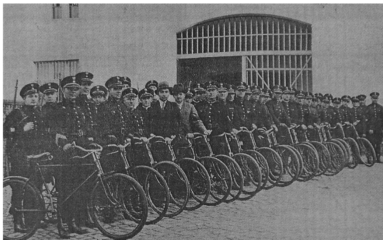
Fig. 6. The team of cyclists from the prison in Rawicz

Source: “Przegląd Więziennictwa Polskiego” [“Overview of Polish Prisons”] 1935, No. 9, p. 14.