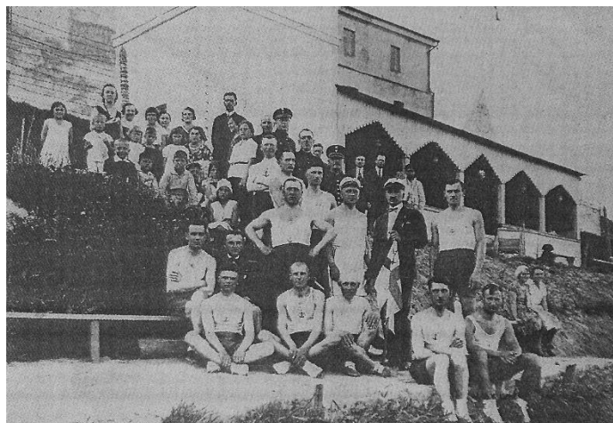
Fig. 3. The opening of the season in the Rowing Club “Temida” in Luck on May 15, 1932