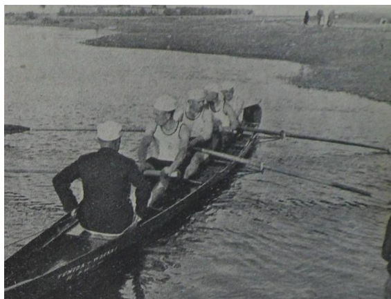
Fig. 5. One of the rowing settlements of the Wronki “Temida”

on rivers, as presented earlier: Luck on the Styr and Wilejka on the Wilia river. In 1935, the construction of the rowing marina on the Warta was completed by employees of one of the largest prisons in Poland –Wronki. The opening ceremony of the facility, dedication and giving the name “Temida” took place in the presence of invited guests from Warsaw and Poznan as well as the authorities of the local prison. With the fleet of several rowing boats and some tourist canoes Prison Guard officers were active until the outbreak of war 30 .