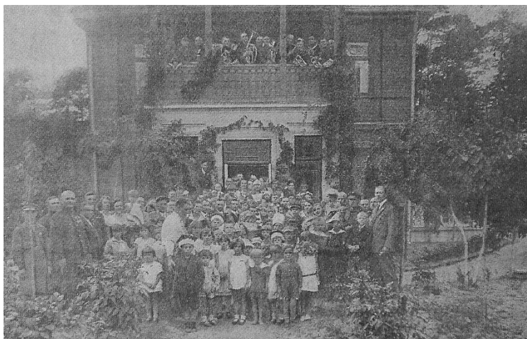
Fig. 1. Prison employees' children camps in the Health and Medical Resort "Orla Strzecha"

area and their families, both for a longer stay, as well as short stays in on Sundays and public holidays. Day trips organized on 15 August and 15 September, when the Health House was visited by about 100 prison employees' children from Warsaw, were the most popular. Childcare and organizing various types of movement games and recreational activities were entrusted to the representatives of the individual departments, who expressed readiness to do social work with children 18 .