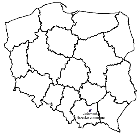
Map 2. The location of Jadowniki PV power plant in Brzesko commune in Małopolskie Voivodeship.