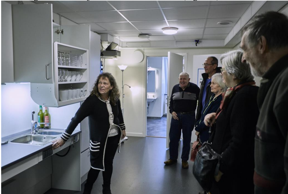
Figure 1. Adjustable interior of kitchen cabinets in the exemplary AAL (Ambient Assisted Living) facility apartment in the Skaraborg Health Technology Centre in Skövde, Sweden

for the elderly than for young people as a result of decreasing height in the elderly. Hrovatin et al. (2015) point out that if illnesses restricting joint movement are also taken into consideration, height accessibility would be even lower. The solution to this design challenge could be providing a range of adjustment features to the furniture. An inspiring example can be found in the Skaraborg Health Technology Centre (SHC) at the University of Skövde which is an exemplary demo arena of a senior-friendly assisted living facility apartment. It showcases among others the adjustable kitchen furniture (Figure 1).