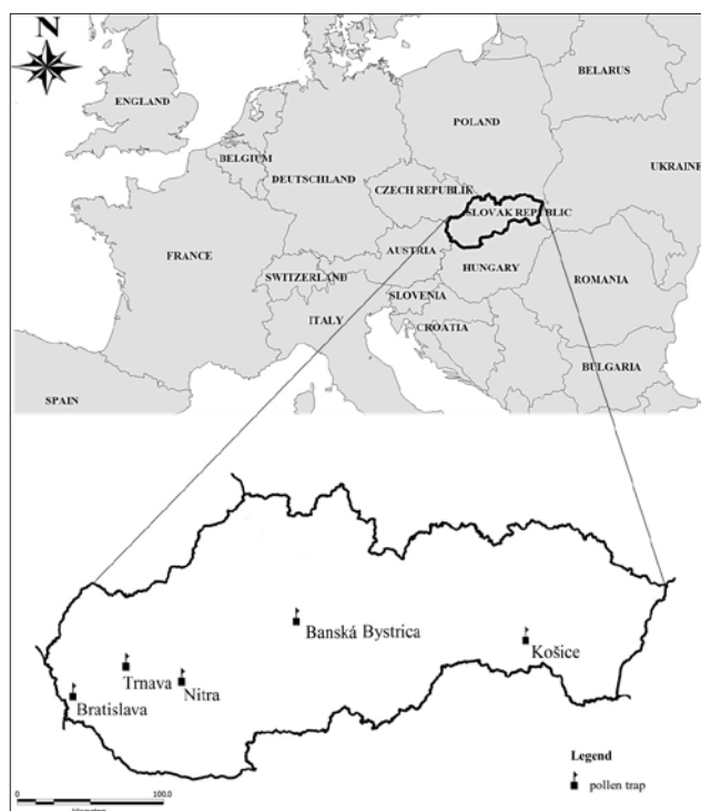
Figure 1. Locations of pollen monitoring stations in Slovakia

The spatiotemporal dynamics of ragweed invasion is evaluated based on: 1) herbarium specimens deposited in the Herbarium of the Department of Botany, Comenius University (SLO), 2) published databases [11, 38] and 3) field investigations carried out during 2004–2014. During the field investigations, potential habitats of A. artemisiifolia , mainly along roads and fields around villages situated in different parts of Slovakia, were inspected. Based on the obtained records, maps indicating the spatial distribution of A. artemisiifolia in Slovakia during four time periods (before 1969, 1989, 2009 and 2014) were compiled.