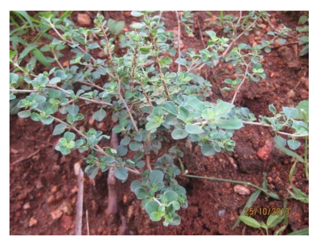
Fig. 1. Habit of Justicia simplex D. Don.

The increasing prevalence of multidrug resistant strains of bacteria and the recent appearance of strains with reduced susceptibility to antibiotics raises untreatable bacterial infections and add urgency to the search for new infection-fighting strategies (Sifradzki et al. 1999). Medicinal plants have been used for centuries as remedies for human diseases because they contain compounds of therapeutic value. Recently, the acceptance of traditional medicine as an alternative from of health care and the development of microbial resistance to the available antibiotics have led authors to investigate the antimicrobial activity of medicinal plants (Nostro et al. , 2000).