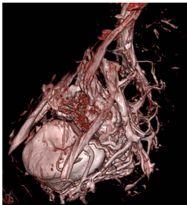
Figure 1. Magnetic resonance scan showing enhanced, bilateral tortuous pelvic veins

Due to the complex aetiology of chronic pelvic pain, the most beneficial effects are obtained when the therapy is based on cooperation between the gynaecologist, physiotherapist, psychologist and interventional radiologist.