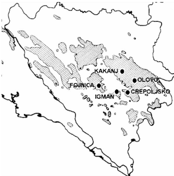
Fig. 1. Silver fir distribution in Bosnia and Herzegovina (Fukarek 1970) and localisation of the populations studied

All the populations were situated at least 30 km away from each other. Two groups were selected within every population, at different altitudes and on different exposures, and were examined separately to ensure that the population in question was represented most effectively. Each subpopulation was represented by 10 selected trees growing at least 50–100 m apart (a given population was represented by 20 trees). Dendrometric