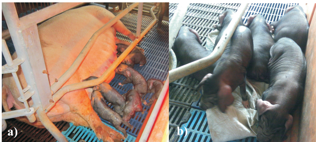
Fig. 2. Meishan pigs cloned by SCNT. Piglets derived from fetal fibroblasts (a) at 1 day of age, (b) at 30 days of age.