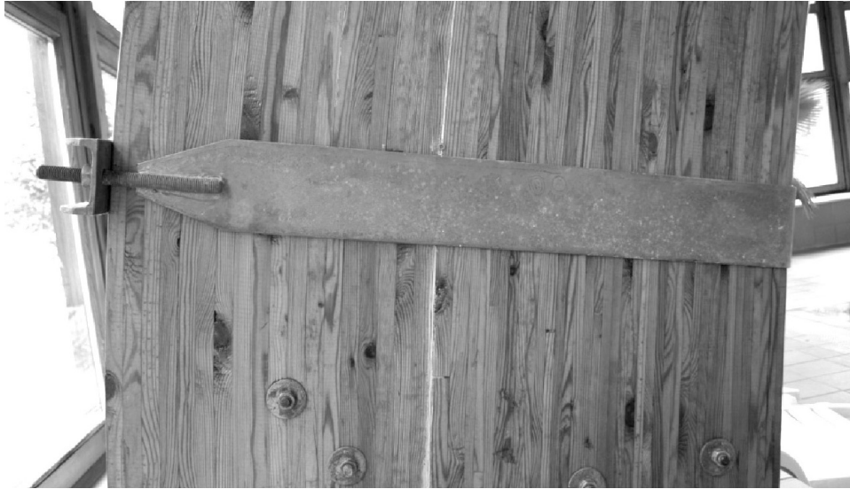
Fig. 1. Steel bandage element on the frame column in the pool at Hajdúszoboszló Rys. 1. Stalowa opaska na kolumnie szkieletu konstrukcji – basen w Hajdúszoboszló

an unusual and quite unknown hardwood material, non-structural purpose PUR adhesive and the unregulated manufacturing process.