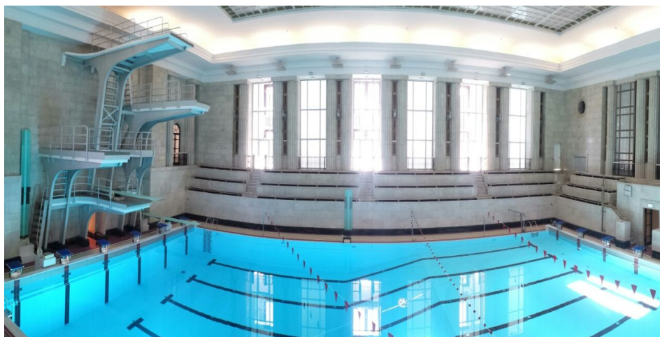
Fig. 4. The Palace of Youth in Warsaw, the indoor swimming pool after modernisation and renovation works in 2016