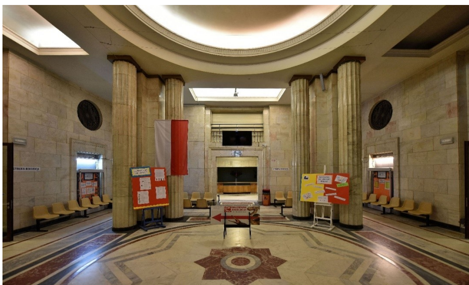
Fig. 2. The Palace of Youth in Warsaw, the main entrance hall