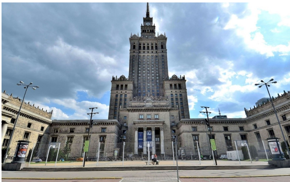
Fig. 1. The Palace of Youth in Warsaw, (source: Adrian Grycuk, 2014, CCA-3.0)