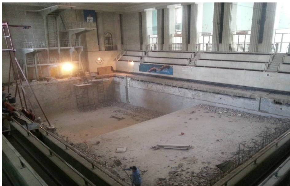
Fig. 3. The Palace of Youth in Warsaw, the indoor swimming pool in 2014, under modernisation and renovation works