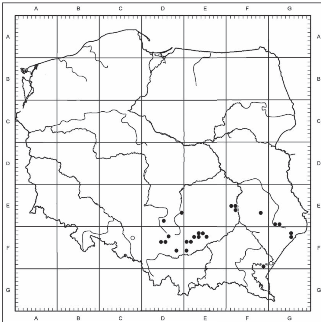
Fig. 1. The distribution of Orobanche picridis in Poland (● – new or confirmed locality, ○ – unconfirmed locality).

localities are rarely found in legally protected areas, and even in those active methods are not used to protect the species. As these sites are not extensively managed, the abundance of the herb layer increases, especially by expansive species, i.e. Arrhenatherum elatius and Solidago species, and thickets and the host, together with the broomrape, are displaced. Due to the small size of areas occupied by the species and necessary active protection, ecological sites where extensive management methods are used (controlling grassland cover increases due to mowing and periodical soil scarifying) should be established. Sowing the host and controlling the localities may be recommended. Periodic soil disturbance is especially useful in seed penetration near the host's roots. The abundance of O. picridis in Wesołówka gradually decreased in wastelands as the vegetation cover increased, whereas it occurred exceptionally numerous in sites rooted by boars. A similar effect were observed in Sławków-Koziół (Ł. Krąjowski, 2009, unpubl.).