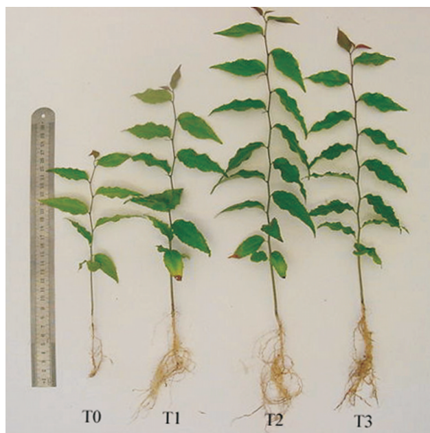
Fig. 4. Growth performance of F. jangomas seedlings four months after sowing the seeds given with different pre-sowing treatments

The total dry weight per plant increased significantly with increasing soaking period up to 48 h (Table 2). Similar trend of total dry weight of the seedlings was reported by Hossain et al. (2005a, 2005b) for T. belerica and T. chebula seedling. Uddin (2005) mentioned that the total dry weight of the T. chebula seedling was highest in seedlings developed from seeds soaked in cold water for 48 h but for T. belerica was the maximum in seeds treated with 72 h soaking in cold water.