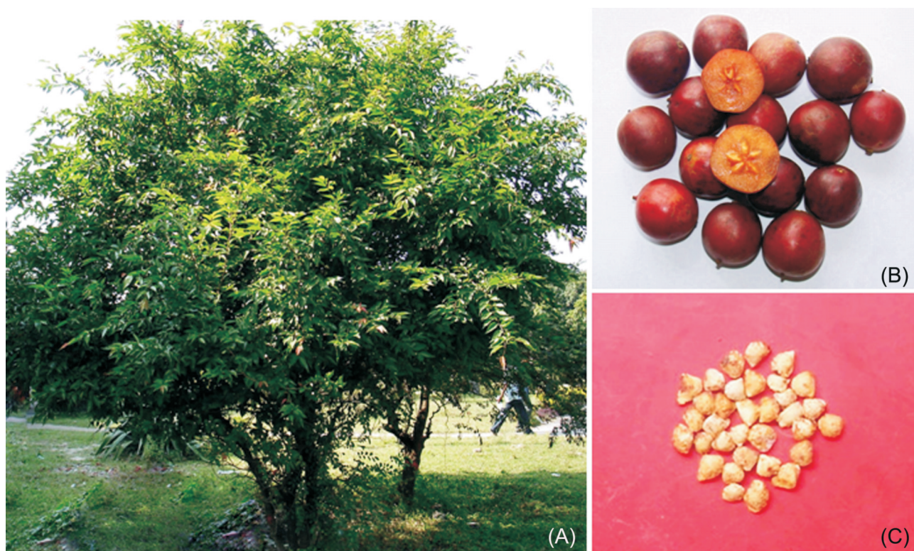
Fig. 1. Full grown trees (a), ripe fruits (b) and seeds (c) of F. jangomas

There are different methods of domestication of plant species including various stages of development as mentioned by Booth and Turnball (1994). Among the stages, regeneration or propagation of the species play vital roles in the domestication process. Plants can be regenerated through seed germination or vegetative means like budding, grafting, stem cuttings or tissue culture. However, very little is known about the regeneration of the F. jangomas . FAO (1984) mentioned that the species is naturally regenerated through seed dispersed by birds. To a limited extent the species is also propagated from seeds in nurseries. The seeds are slow to germinate; therefore propagation is usually by inarching or budding onto self-seedlings and with rare exception of invitro regeneration (Chandra and Bhanja 2002). The information about