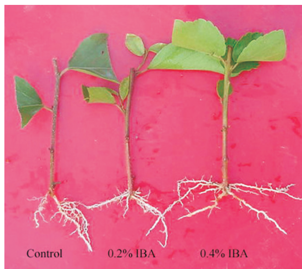
Fig. 5. Rooting ability of cuttings of F. jangomas treated with various concentrations of IBA solution

Applied rooting hormone IBA is known to intensify the rooting percentage of cuttings as cited by many authors. For examples, Hossain et al. (2002) re-