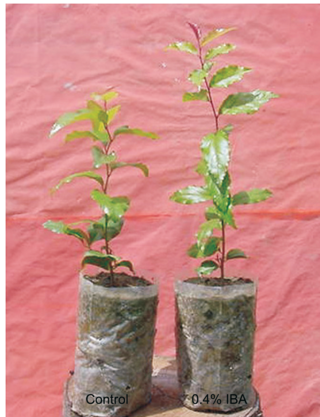
Fig. 6. Growth performance of F. jangomas cuttings rooted as IBA treatment three months after transferring into polybags

Shoot height was significantly affected with the increase of IBA concentration (Table 4). The longest shoot (6.6 cm) was observed in cuttings treated with 0.4% IBA solution followed by 6.3 cm in 0.2% IBA treatment. However, this result was not possible to compare with other authors due to lack of related references.