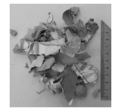
Figure 1. The shredded Tetra Pak material

The tested particleboards were made of industrial pine particles and Tetra Pak packaging. Tetra Pak packages were collected from household waste sorting. The plastic upper part, including opening and closure elements, were removed from the packaging, and the remainings were mechanically shredded using a branch shredder. During shredding, partial delamination of this material occurred. The crushed material was sorted using a 40 mm sieve. Figure 1 illustrates the shredded Tetra Pak material.