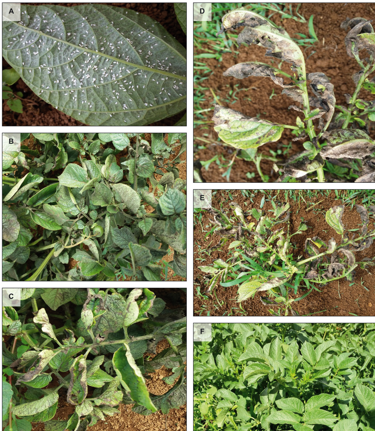
Fig. 1. Potato plants infested with Trialeurodes vaporariorum . Newly infested leaves (A), sooty mold forming on the leaf surface (B), necrosis on the leaf margins and leaf cupping (C), dead leaf (D), heavily infested plant starting two weeks after plant emergence (E), and weekly insecticide sprayed plants (F)

Whitefly abundance and tuber weight in sprayed and unsprayed plots were compared by t-test at 5% level and the average yield loss was calculated. Using methods of the local farmers, fungicide was applied weekly to control late blight disease in both insecticide treated and untreated plots. Another insect pest that usually causes economic damage to potato in the research site is Liriomyza huidobrensis (Blanchard); however, the pest population was very low during the trial. Therefore, insecticide applications were solely for suppressing the greenhouse whitefly population.