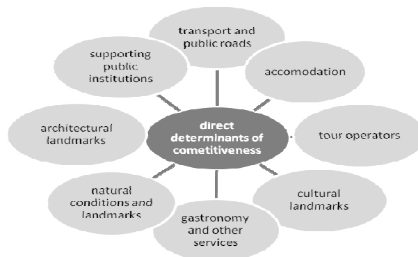
Fig. 1. Direct determinants of tourism competitiveness of a city

providers. What matters is not only their number, but also quality, which is understood as an ability to satisfy client needs (Fig. 1).