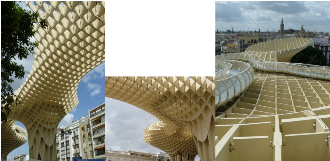
Fig. 2 Metropol Parasol in Seville

Timber has many advantages, one of them is the fact that the nature gives it every day, and the growing process helps to improve the quality of air. It can be used to create friendly interiors. Additionally glulam and wood based composite materials (for example lvl or cross-laminated timber) allow to give the construction an interesting shape. This year one of the finalists in the European Union Prize for Contemporary Architecture. Mies van der Rohe Award was Metropol Parasol in Seville – a specific wooden construction made of 2500m 3 lvl (Kerto Q). The structure is approx. 150m long, 75m wide and 28m high and creates the roof over the market.