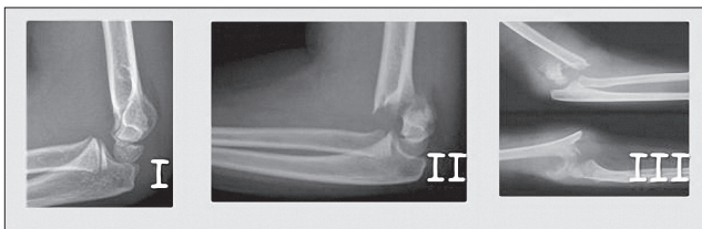
Figure 2. Gartland classification.

Type I. Extension type of fracture, with the line of fracture extending horizontally or obliquely and extending upwards and posteriorly in the distal part of the humeral bone. Depending on the severity of the fracture, posterior displacement of the distal fracture fragment and anterior displacement of the proximal fracture fragment may occur. In analysis of the displacement of the broken fragments, the Gartland classification has been used. All analysed fractures were Gartland II or III type (Fig. 2).