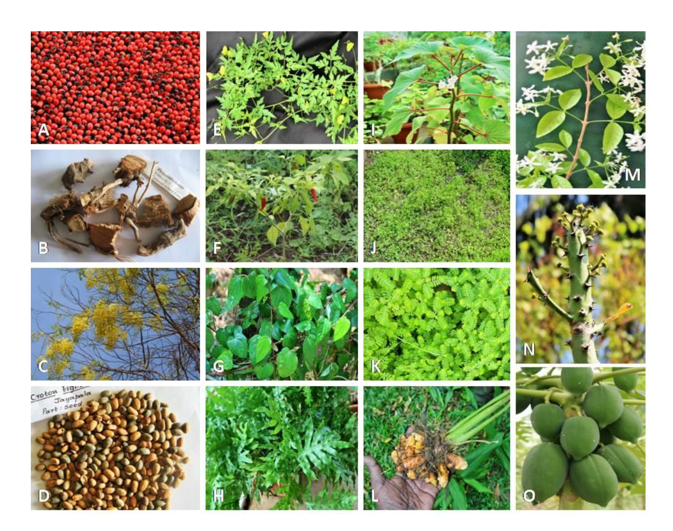
Figure 2. A. Abrus precatorius L. (seeds), B. Calamus rotang L. (Rhizome), C. Cassia fistula L., D. Croton tiglium L. (seeds), E. Cardiospermum halicacabum L. (leaves), F. Capsicum frutescens L, G. Piper betel L., H. Drynaria quersifolia(L.) Roemer &Schultes, I. Begonia malabarica (Lam.) Trivengadam, J. Oxalis corniculata L., K. Phyllanthus amarus Schumach. Ex Thonn., L. Curcuma domestica Valeton (rhizome), M. Wrightia tinctoria R.Br., N. Euphoria nivulia Buch.- Ham., O. Carica papaya L.

Among the 41 species 32 are dicot, eight species belongs to monocots and one fern species. List of plant part wise usage in the folklore claims are enumerated in Figure 3. Root and rhizome is used to cure 13 ailments. Leaves are employed in 10 preparations, stem and stem bark are reported in treating 5 diseases. Seeds and fruits are used in 2 ailments each. Whole plant is exploited in curing 7 ailments. Aerial root Ficus , endosperm milk of Cocos , latex of Carica and bulbs of Allium cepa are enumerated in treating diseases. Sixteen single drug administrations was observed in treating cough in children, diarrhoea, dental sensitiveness, sinusitis, stomach ulcer, constipation, delivery, scorpion sting, incised wounds, destroy lice, stomach ache, jaundice, dysentery and fish poison. More than one drug is used to cure snake bite, ear ache, cough followed by chest pain, tooth ache, bowel complaints, indigestion, gastric ulcer, convalescence, fever, cough due to phlegm and as male contraceptive medicine.