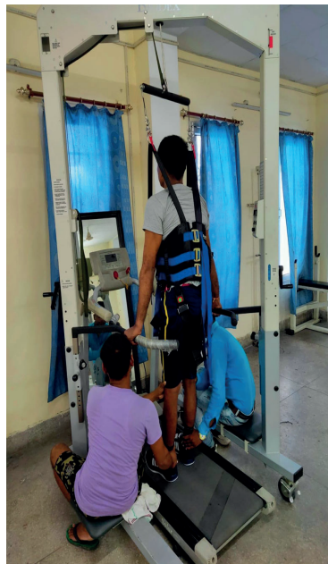
Fig 1. Showing Partial Body Weight Treadmill Training of a patient having paraplegia Incentive spirometry: standard Ramson® 3 ball incentive spirometer was used.

PBWSTT group received 16 sessions (30 min/session; 4 days/week for 4 weeks) of PBWSTT with manual stepping assistance while being suspended by a harness (Robertson Harness, Henderson, NV) and body weight support system (Innoventor, St. Louis, MO) over a treadmill (Biodex Medical Systems, Shirley, NY) under supervision of a single trained Physiatrist. The level of weight support was adjusted to maximize bilateral limb loading without the knees buckling during stance. A single trained physiotherapist positioned behind the subject aided in pelvis and trunk stabilization, as well as appropriate weight shifting and hip rotation during the step cycle. This manual assistance was done to facilitate knee extension during stance, knee flexion, and toe clearance during swing. The treadmill speed was adjusted to promote the best stepping pattern at the given body weight load. Speed was maintained within a normal walking speed range (0.80–1.40 m/s). Body weight support was continuously reduced over the course of the training sessions as subjects increase their ability to bear weight on the lower limbs [Fig 1].