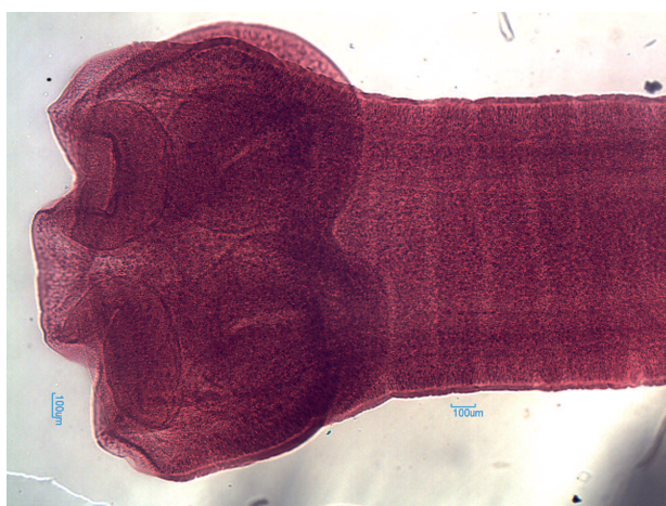
Figure 1 C. Moniezia benedeni : scolex and neck (Fuchsin stain)

quantity, and in other cases, the intestinal content was replaced by the body of the tapeworms. The intestinal wall is mildly thickened, presented a velvety, shiny mucosa, covered by catarrhal exudate. The morphological exam of the tapeworms extracted from the intestine of the young goats confirmed the belonging to the Anoplocephalidae family, Moniezia genus. The macroscopic and microscopic investigation of the tapeworms confirmed the mixed infection of the young goats with the M. expansa and M. benedeni species. Moniezia expansa has a long flattened and segmented body, white-yellowish; it has 2.0–6.0 m length × 15–25 mm width. The small, globular scolex (0.7 mm), without rostrum, has four oval suckers (Fig. 1A). The neck, unsegmented and long, is followed by the immature area in which the internal structure of the proglottids is a little visible. The mature proglottids are rather wide than long (15.0 × 3.0 mm), have double genital organs, and bilateral genital pores. The ovaries are lobular, recurved, with the concavity placed posteriorly. The vitellogenin glands are found in the concavity of the