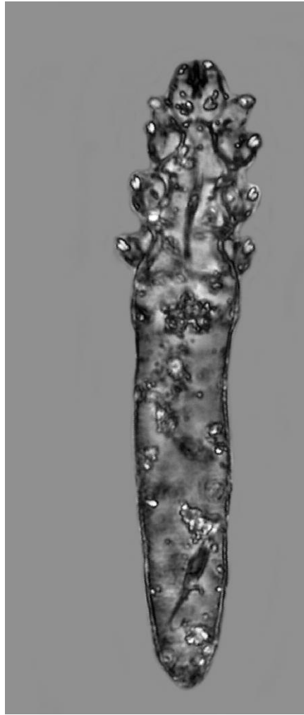
Fig. 2. Demodex ratticola , male