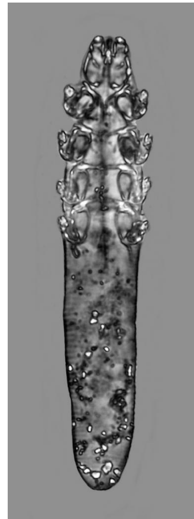
Fig. 3. Demodex ratticola , female