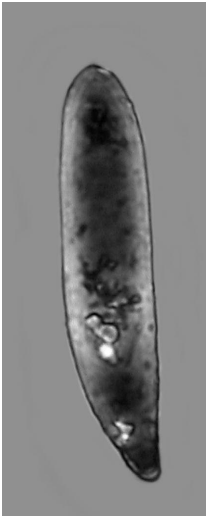
Fig. 1. Demodex ratticola , egg

Although, individual species of demodectic mites are listed in different textbooks on diseases and parasites of rats, actual and documented records are missing in the related literature. Nevertheless, despite the lack of available data on the occurrence of synhospital Demodex spp. in brown rats from