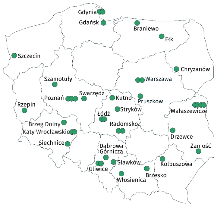
Figure 4.: Distribution of intermodal terminals in 2021