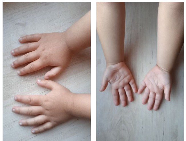
Figure 3. Arms of the patient with Wiedemann-Steiner syndrome. Note characteristic features: brachydactyly, puffy hands