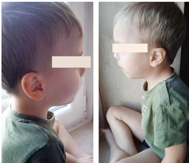
Figure 2. Face of the patient with Wiedemann-Steiner syndrome. Note characteristic facial features: flat face, low-set ears, wide, slightly concave nasal bridge, smooth philtrum

No genomic imbalance was found in microarray-based comparative genomic hybridization (aCGH). Next-generation sequencing (NGS) and whole-exome sequencing (WES) was commissioned, augmented by an analysis of