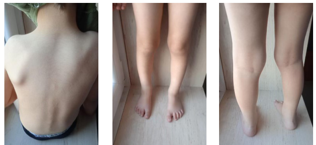
Figure 4. Back and feet of the patient with Wiedemann-Steiner syndrome. Note characteristic features: hypertrichosis of the back, small and flat feet

the complete mitochondrial genome and a panel of known pathogenic variants beyond the exome. The Twist Human Core Exome 2.0, Comp Spike-in, and Twist mtDNA Panel (Twist Bioscience) kit were used to perform the study. Analysis of DNA copy number variation (CNV) showed no changes that could explain the proband's symptoms. In WES, a change in the KMT2A gene at the p.(Lys1176Asn) protein level at the cDNA level c.3528G>T of a missense type was diagnosed (NM_005933.4:c[3528G>T];[3528=]). The variant in the proband's parents was excluded ( de novo lesion).