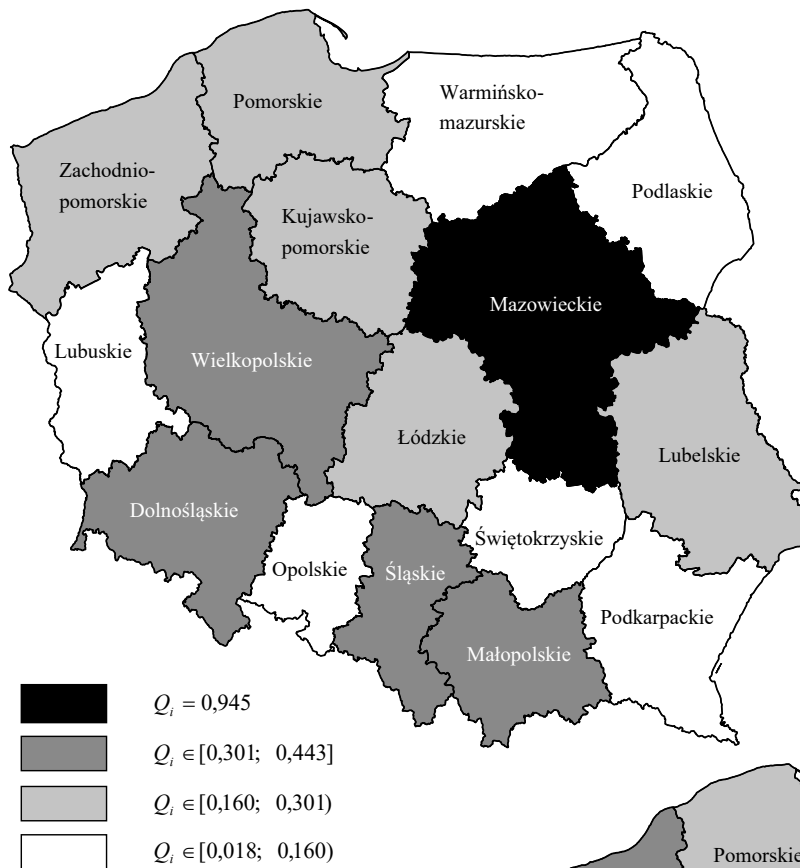
Fig. 1. Voivodeships according to the level of waste management in 2013