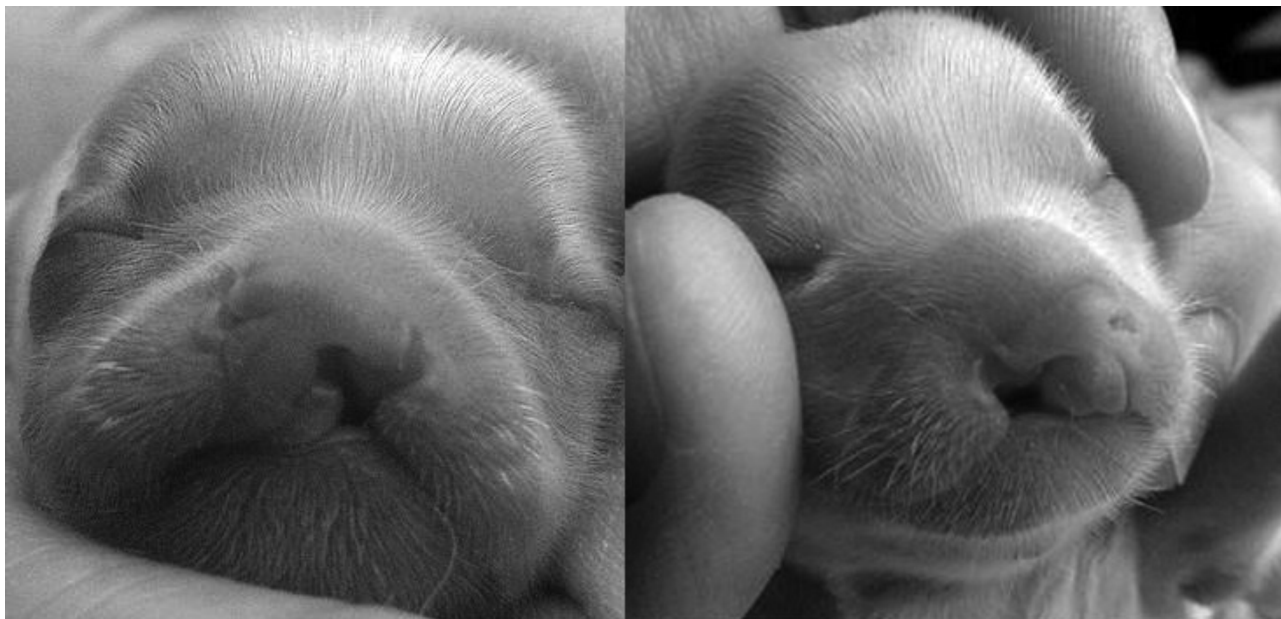
Fig. 3. Cleft of lips and palate in littermate Chihuahua puppies.

caesarean sections were performed 8 times (4 times in Pugs and 4 times in Chihuahuas), whereas, after supplementation it was performed 3 times (2 caesarean sections in Chihuahuas and 1 in Pug).