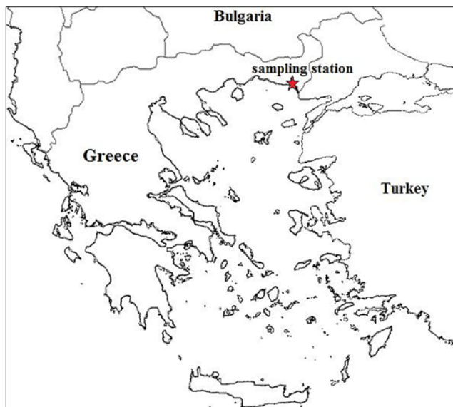
Figure 1. Map of study region

The city of Alexandroupolis is situated in North-Eastern (NE) Greece, at 40.51' N 25.52' E. It has a typical Mediterranean climate, with an average daily temperature of 14.9°C, relative humidity of 67.4% and 549.3 mm total precipitation per year. It is situated near the delta of the Evros river, 40 km from the border with Turkey, 302 km West of Istanbul and 750 km North-East of Athens (Fig. 1). Local vegetation includes evergreen, deciduous and fruit trees (e.g. pines, cypresses, oaks and olives), as well as a variety of other shrubs, grasses and herbs (e.g. mugwort, laurel, mint, thyme) that create a diverse polinological environment.