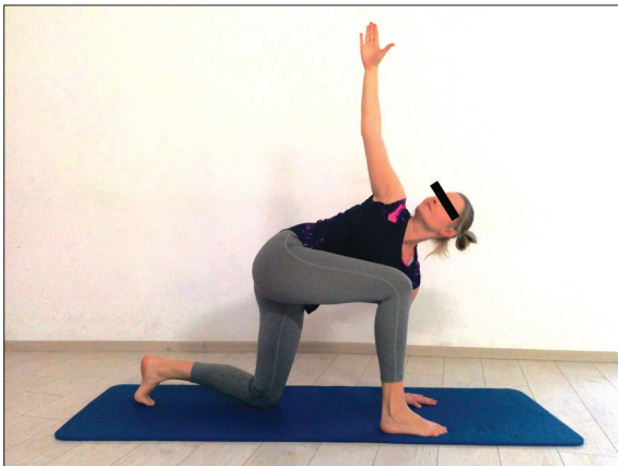
Figure 4. Example of bodyART exercise

BodyART exercises are performed without any additional accessories using just the weight of the body. The pace is calm and the movements smooth and harmonized with the breath. At the entry level of training, practitioners learn to maintain stable correct positions, and after achieving this skill, more and more difficult elements are introduced. Ultimately, the main content of the training is a combination of multi-articular movements in all planes with a large balance component, involving simultaneously many muscle groups (Figure 4) (BODYART International, https://international.bodyart-training.com/info/history ; Burzawa, 2017).