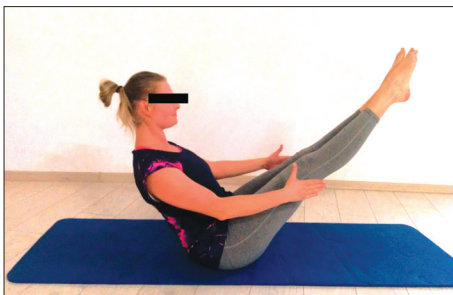
Figure 2. Pilates – Teaser

Pilates training is based on simple exercises with a small load matched individually and regularly increased. Its level of exercise is raised not by multiplying the number of exercises, as in the case of strength training, but by extending the time of isometric tension of the muscles and by improving the quality of movement, which leads to strengthening without excessive mass gain. Exercises are performed on mats, without additional load, and the most often used positions in this form of training are various types of sitting and lying positions (Figure 2 and 3). Exercises can be also performed with additional accessories such as balls, elastic bands and sticks. Regular training leads to an improvement in dynamic postural control and balance, which is achieved by gradually introducing more and more complex multiplanar movements of the trunk and limbs. Pilates also positively influences the body posture, develops the movement potential and body endurance and reduces stress levels, thus affecting an overall improvement in health (Podciechowska et al., 2015; Sorosky et al., 2008; Kloubec, 2010; Mazur, Marczewski, 2011).