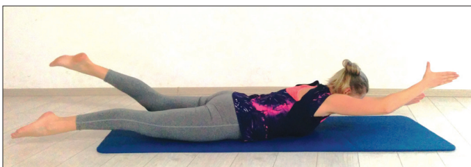
Figure 3. Pilates – Swimming