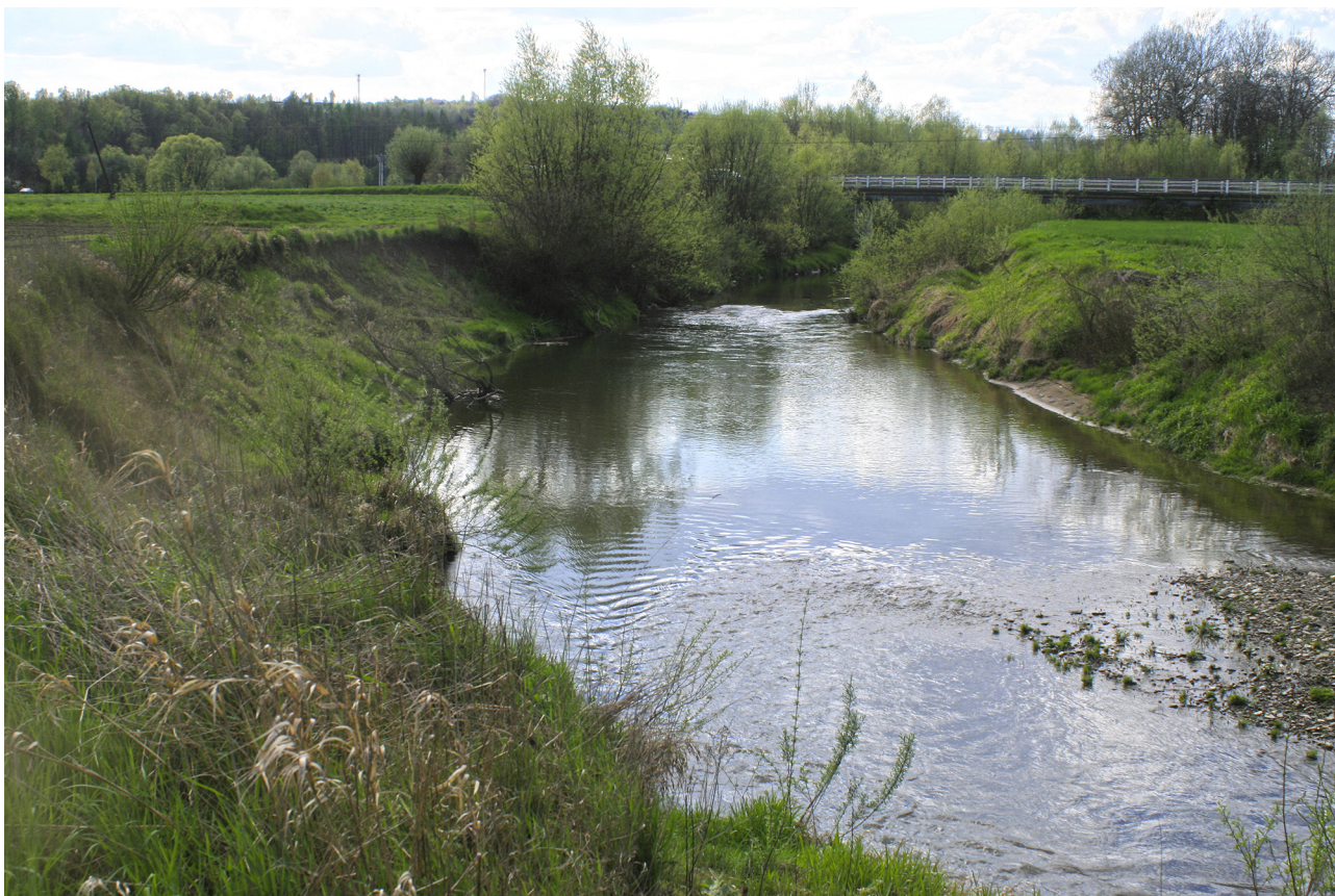
Fig. 3. One of natural microhabitats of the thick-shell river mussel Unio crassus Philipsson, 1788 in the Stradomka river – external side of a meander with clay substratum

Grabie village (208 m a.s.l.); it was not recorded upstream of this site. In the Trzciański stream the highest locality was Trzciana village (238 m a.s.l.). The only site in the Tarnawka river was in the environs of Boczów (234 m a.s.l.) and the only one in the Polanka was near Zalesie (216 m a.s.l.). One-year specimens were found in three sites in the Stradomka river; one well preserved one-year shell was recorded in the Tarnawka river. The number of observed individuals ranged from one to 86. Habitats where U. crassus was found included gravel rapids, mud deposits within large stone artificial embankments and clay sediments (Fig. 3). Potential fish hosts of glochidia in these watercourses were L. cephalus and Phoxinus phoxinus . No other bivalves were found in the Stradomka and tributaries.