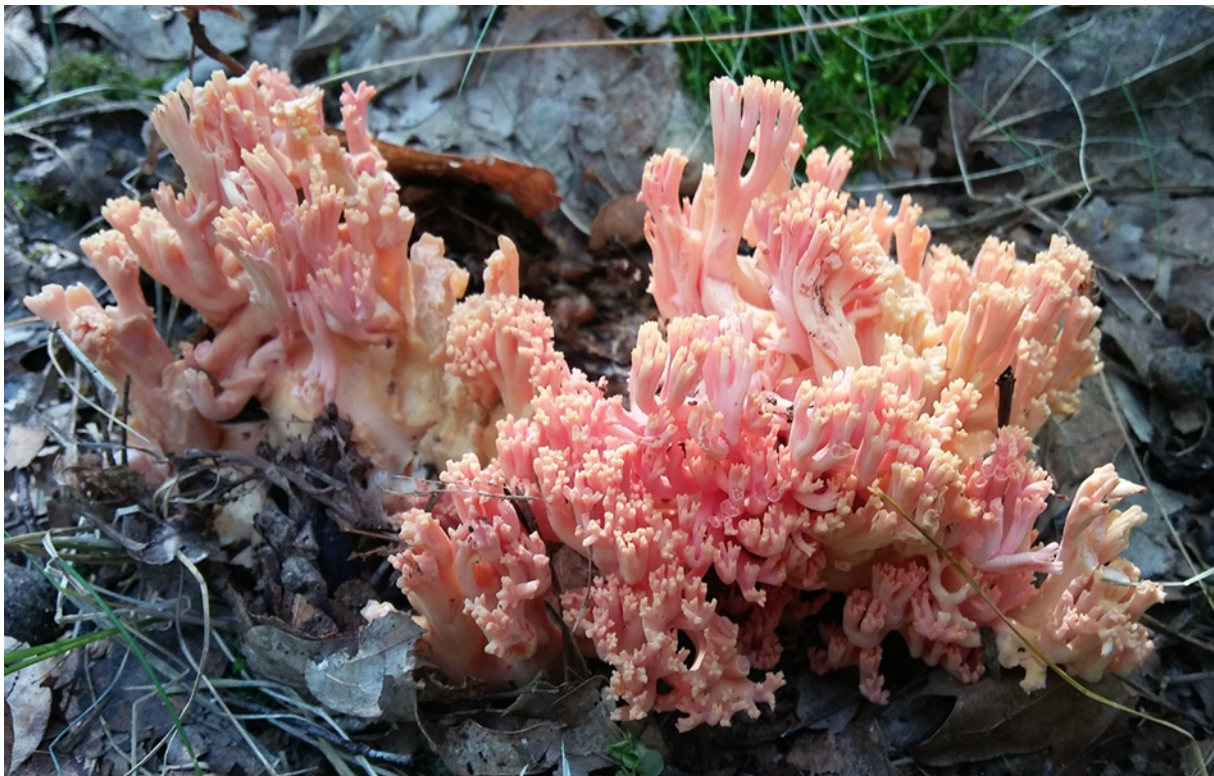
Figure 3 Basidiomata of Ramaria subbotrytis from the Kampinos National Park; September 19, 2020.

Ramaria subbotrytis (Coker) Corner (Figure 3). Specimen examined: KNP, Zaborówek, 1.5 km NNW, Leszno municipality, Kampinos PD, Rózin PSD, forest