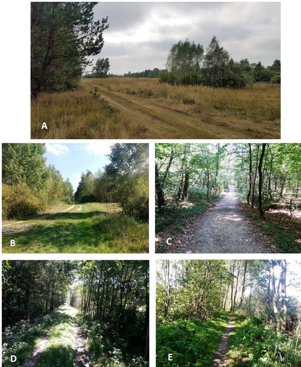
Figure 2. Ecologically different habitats of Dermacentor reticulatus located in the Polesie National Park: A- locality 1; B – locality 2; C – locality 3; D – locality 4; E – locality 5.

previous studies [13]. Ticks were usually collected only on clear days without precipitation and with moderate or no wind.