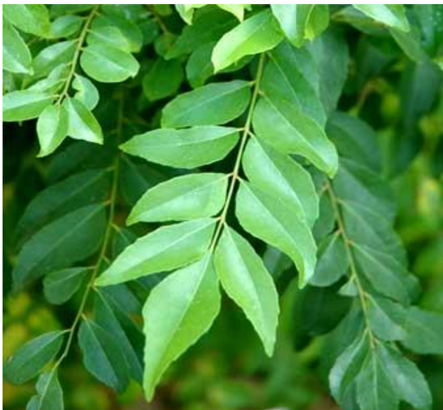
Fig. 1. Murraya koenigii (Linn.) Spreng. (Habit).

The macroscopical studies revealed the shape of leaves of Murraya koenigii (L) Spreng as obliquely ovate or some what rhomboid with acuminate obtuse or acute apex, bipinnately compound with exstipulate in alternate arrangement. The petiole were of 20 to 30 cm in length. The leaf had reticulate venation and dentate margin with asymmetrical base (Fig. 1 & 2).