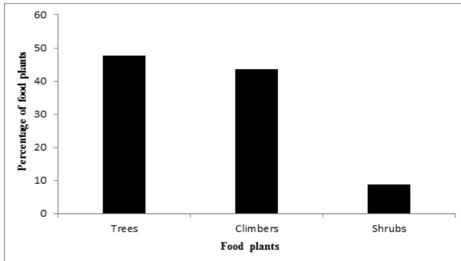
Figure 1. Percentage of different food plants eaten by GGS in Senbakathoppu valley during the study period from December 2011- March 2012.

study area but there was no competition observed between these three species. The availability food plants and food parts preference in different months in Reserve forest was very low compared to other two habitats. This could be the possible reason for the squirrel to invade to Private Land and Temple Land. Squirrels restricted their movement in Reserve forest probably because of low canopy continuity and availability of limited resource. As a result they tend to spend lesser amount of time on other activities.