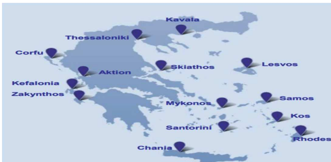
Figure 1. Map of fourteen regional airports operated by FG