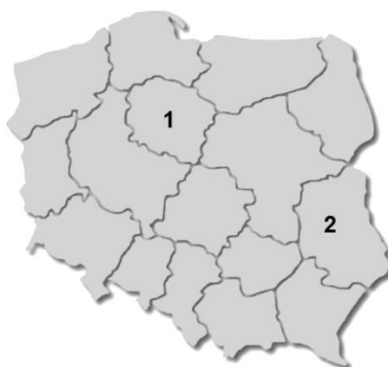
Fig. 1. Location of surveyed regions in Poland. Explanation: 1. Kujawsko-Pomorskie 2. Lubelskie

Kujawsko-Pomorskie is situated in the central part of Poland while Lubelskie is in the south-eastern part (Fig. 1). Kujawsko-Pomorskie and Lubelskie are very important regions in terms of agricultural production in Poland due to essential resources and outputs in relation to other regions (BDL GUS, 2014). Synthetic measures of the value of regions in agriculture are very high as compared to other regions in Poland (Tab. 1).